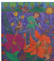
Effets de cordes (2009.006)